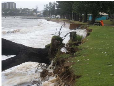
Queen's Beach South