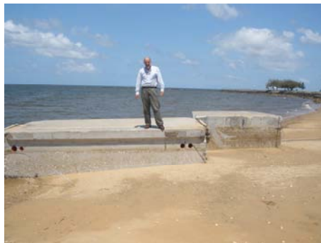
Brisbane City Riverwalk at Queens Beach

Imagine the damage if Wivenhoe Dam had not been constructed, the photo below shows the water in Wivenhoe held back by the flood gates.