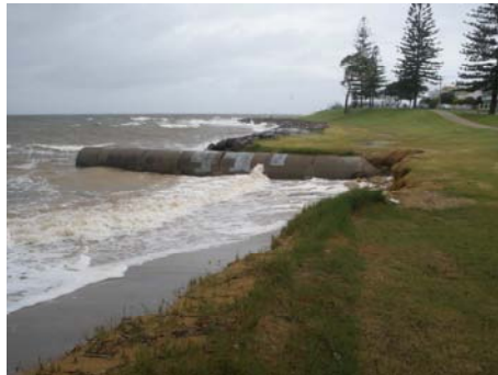
Scarborough Beach, southern end

Moreton Bay Fishing – Sediment surveys have enabled the fishing industry's voluntary stoppage to be lifted in other parts of Moreton Bay, which has given the all clear to commercial and recreational fishers. Please support your local business by eating local seafood. Prawns have never been cheaper than at the moment.