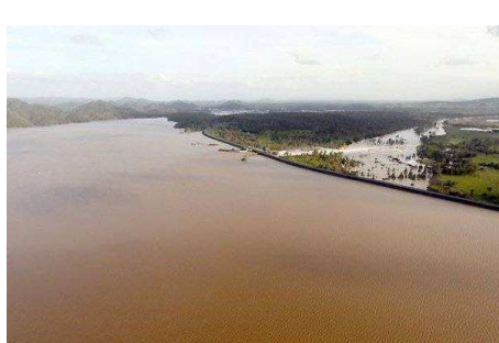
Inside Wivenhoe Dam

Imagine the damage if Wivenhoe Dam had not been constructed, the photo below shows the water in Wivenhoe held back by the flood gates.